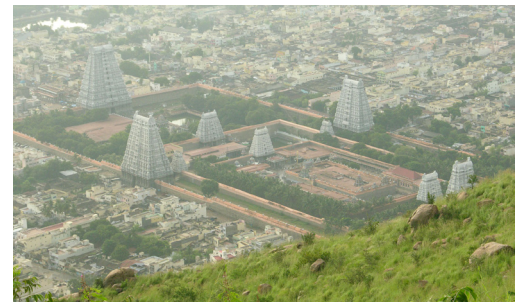
view of Arunachaleswarar Temple from top of the mountain

Day 16: Chennai sightseeing - Visit Desikichar's renowned yoga center. Do last minute shopping. In the evening, return to the USA.