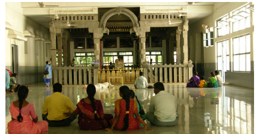
Sri Aurobindo's ashram