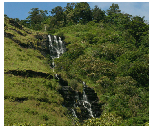
hiking the Coorg Valley