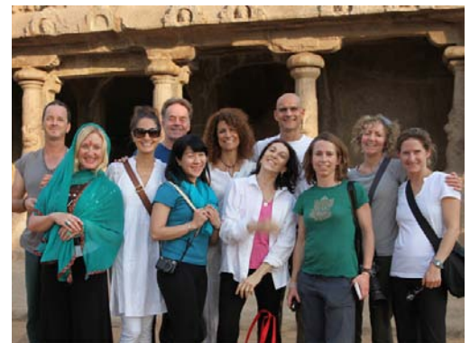
Mammalapuram Rock Temples