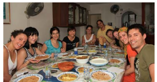
Leelu's Cooking Class, Cochin