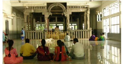
Ramana Maharshi's ashram