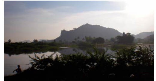
Mt. Arunachal, Tiruvannamalai

They say in India, "Sub Kulch Malega," meaning, Anything is Possible. Things rarely happen quite like you expect. Our schedules are an outline. In the event of unforeseeable circumstances the itinerary may change. An enjoyable experience takes precedence over everything else. The itinerary will change so we recommend having an open mind and no expectations!